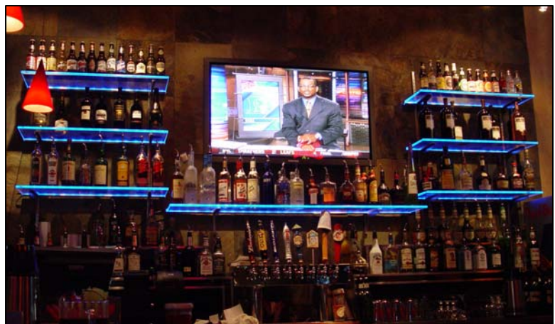
Shelf lighting using a single piece of blue Plexineon per shelf

Plexineon is known for its myriad of applications: architectural trim, cove lighting, and signage among others. Our unique products make nontraditional and creative lighting options possible. Take for example the retail applications used in the photograph of New York Pizza to the right. Blue Plexineon was applied to the back of each shelf, drawing attention to featured products and creating a fun, modern atmosphere.