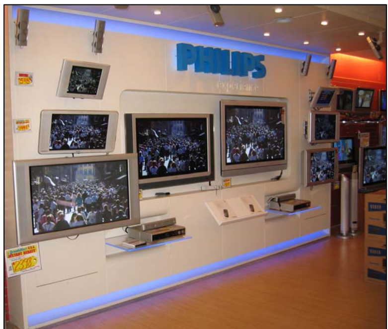
Phillips backlit display Partner with partner Czarnowski

Not only can Plexineon be used as direct lighting in a retail environment, it can also be used for backlighting product displays. The soft blue glow of this Phillips display draws subtle attention to showcased products without overpowering them. The designers originally used fluorescent bulbs with colored film to achieve a blue hue. But since the maintenance costs associated with fluorescents were too high, Plexineon was substituted due to its low maintenance costs and long lifetimes.