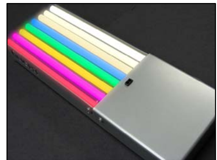
Small Rep Kit

Our new small rep kits have been a huge success. Designers and reps enjoy the compact construction and lightweight, portable design. The small rep kit displays an entire range of vibrant Plexineon colors, including our Daytime Series (red, amber and green), magenta, blue and the three temperatures of our White 1X Series. The small rep kit is easy to transport and comes in its own canvas carrying case, making it ideal for traveling and sales calls. Weighing only 4 \frac{1}{2} pounds, this powerful sales tool is literally in the palm of your hands.