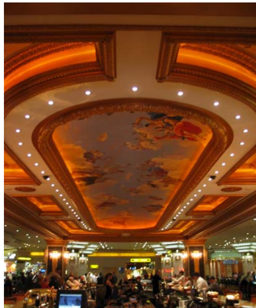
iLight's Amber Plexineon in Caesar's Casino

700 linear feet of golden colored Amber Plexineon decorates the ceiling coves in this main bar area in Caesar's Casino in Atlantic City, NJ. Architectural representatives, Penn Lighting worked on this job.