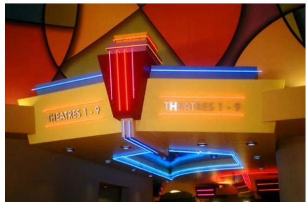
Regal Entertainment Group in Corona, CA

Movie theaters have historically used glass neon to add that extra color to the interiors and exteriors of their theaters. Plexineon has been a great solution for theaters to keep that great bright neon look without the high voltage. And Plexineon uses far less energy making it a safe and energy saving accent lighting solution.