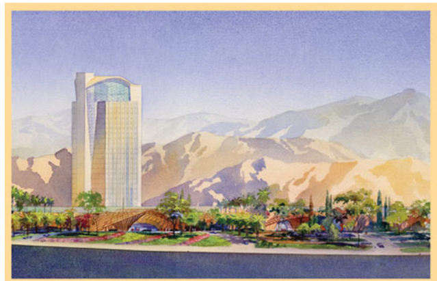
RENDERING OF MORONGO CASINO, HOTEL AND SPA

6500°K White Plexineon is really adding some pizzazz to newly designed Morongo, Casino, Hotel and Spa in Southern California thanks to White & Associates of LA . Designers, Visual Terrain , selected to accent various interior and exterior locations with 2000 feet of White Plexineon. Installation slated for the end of June.