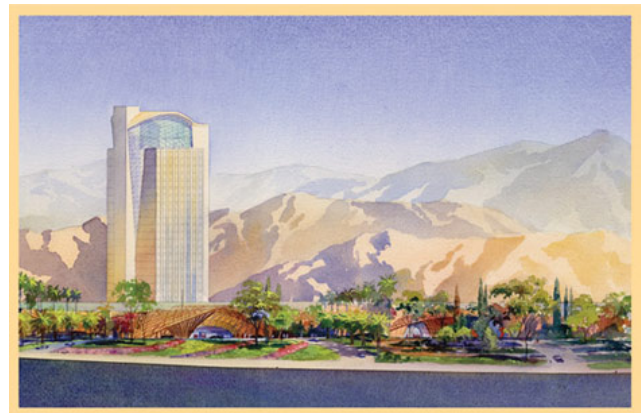
RENDERING OF MORONGO CASINO, HOTEL AND SPA

6500°K White Plexineon is really adding some pizzazz to newly designed Morongo, Casino, Hotel and Spa in Southern California thanks to White & Associates of LA . Designers, Visual Terrain , selected to accent various interior and exterior locations with 2000 feet of White Plexineon. Installation slated for the end of June.