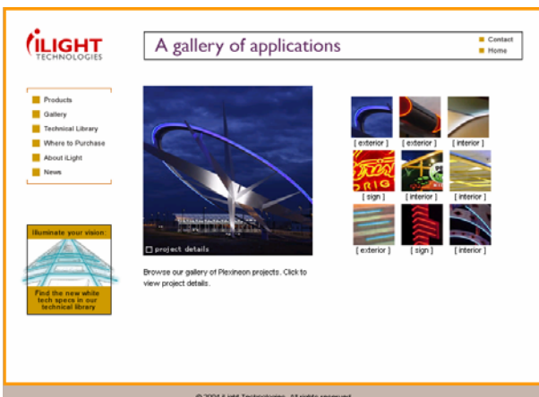
The new iLight Gallery section of site at www.ilight-tech.com .

iLight has unveiled its newly redesigned Web site at www.ilight-tech.com . The site will be a great resource for the latest technical documentation, photos of various installations, and general information.