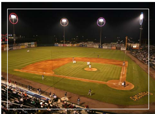
Keyspan Park with new lower maintenance Plexineon.

Architectural Representative: Enterprise Lighting Sales of NY